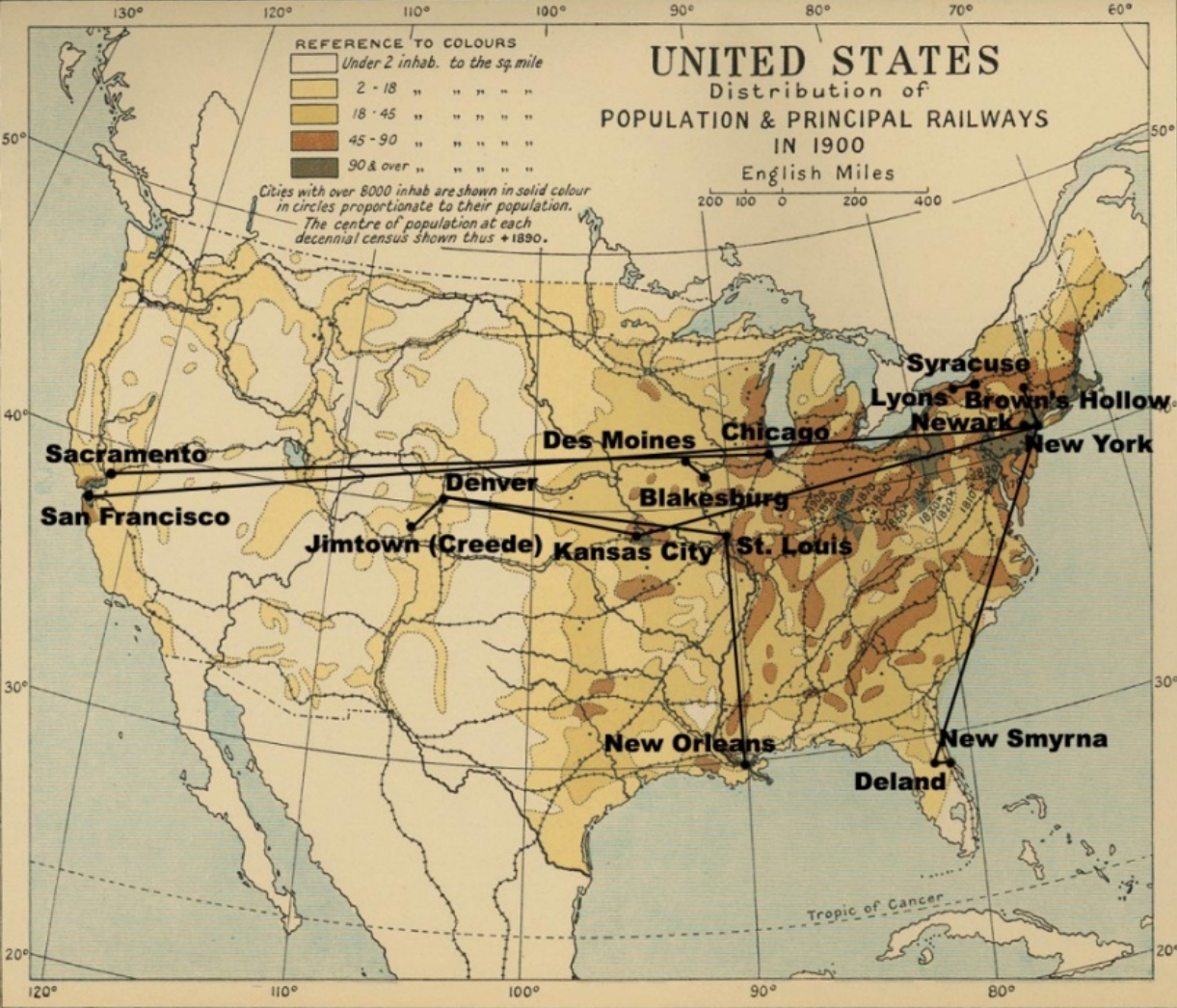
Fig. 1. The Movements of Nick Carter.

Chicago in Illinois, Sacramento and San Francisco in California, Des Moines in Iowa, Denver in Colorado, Kansas City and St. Louis in Missouri, New Orleans in Louisiana and to rural Nevada. Carter visits all these places in the space of fourteen sixteen-page stories – and wherever he arrives, he overcomes the villain.