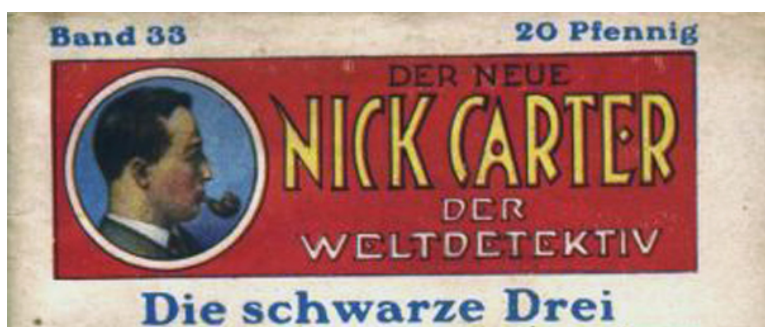
Fig. 4. Der neue Nick Carter: Der Weltdetektiv, Bd. 33: Die schwarze Drei .