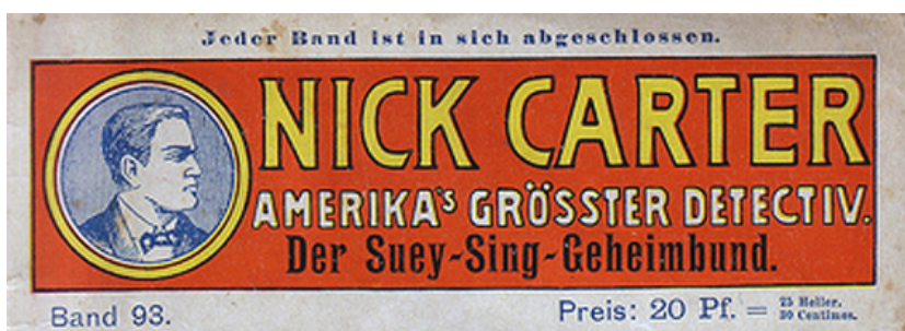
Fig. 3. Nick Carter: Amerika's grösster Detectiv, Bd. 93: Der Suey-Sing-Geheimbund .