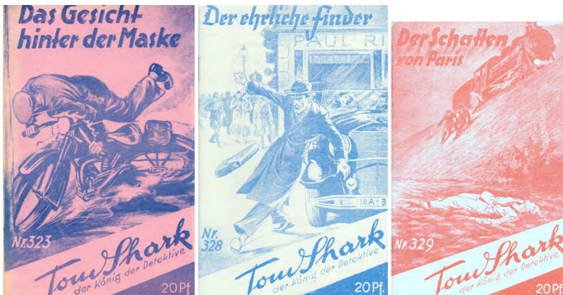
Fig. 4: Book covers from the Tom Shark series, nos. 323, 328, 329.