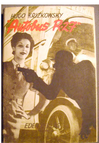
Fig. 2: Dime Novel Covers from the 1920s and 1930s