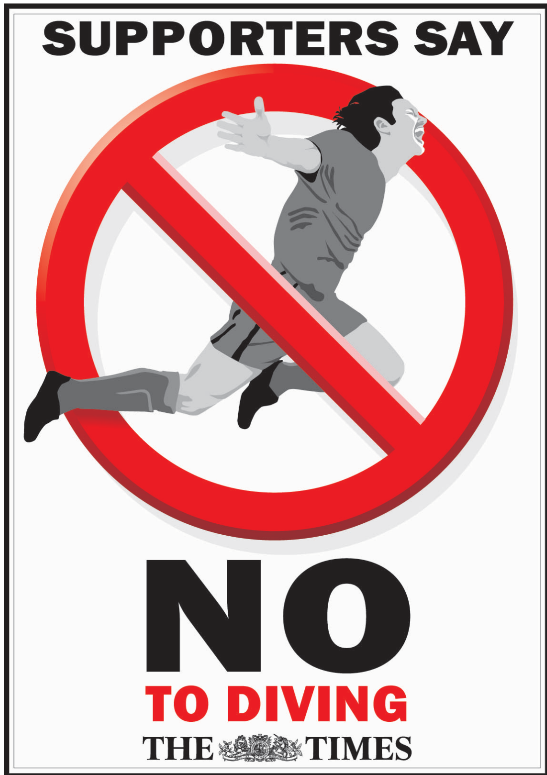
Image 5: www.timesonline.co.uk/nodiving (30.09.2006)