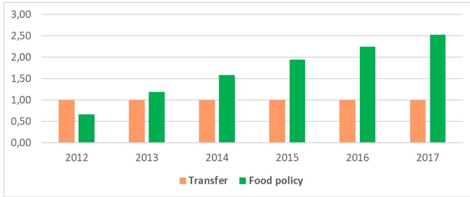
Figure 2: Relative effects of policy interventions triggering peace

possible to stabilize the economic growth rate of Syria by an amount of money equal to 5% of the Syrian GDP in 2012, then this would lead to an increase of the economic growth rate of 2012 by 0.04 pp. For the same amount of money (5% of GDP in 2012) invested in increased in food production it would add 0.07 pp on food production in 2012. Therefore, proper food policies that enhance food security seem to play a role toward peace.