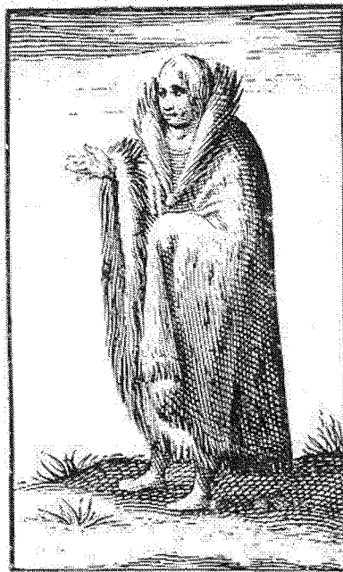
The wilde Irish Woman

38, 39, 40, 41. FROM SPEEDE'S MAP OF IRELAND, 1610.