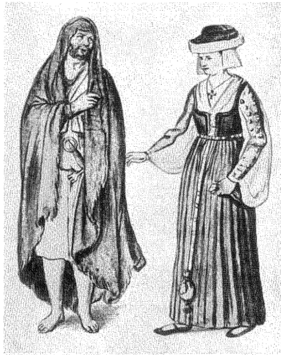
21. WATER-COLOUR DRAWING OF AN IRISH NOBLEWOMAN AND A "WILD" IRISHMAN IN A MANUSCRIPT BOOK BY LUCAS DE HEERE in the Library of Ghent University, Belgium.

(Photograph from the British Museum, from a reprint of de Heere's book made in 1937.)