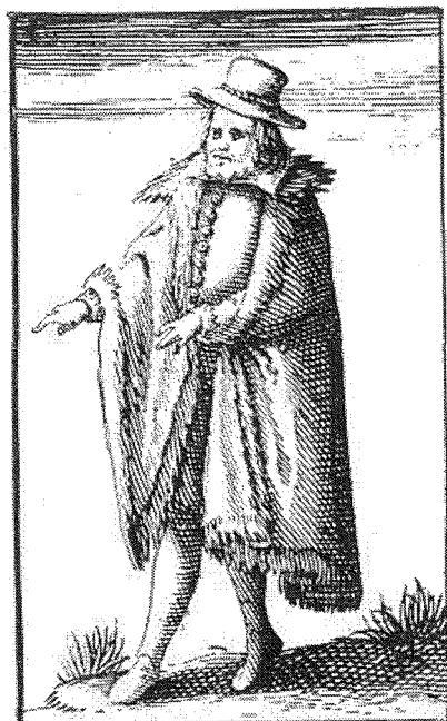
The Civill Irish man