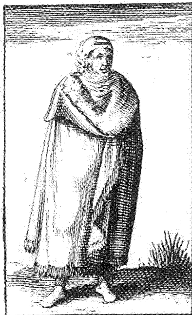
The Civill Irish Woman