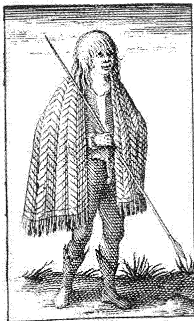
The wilde Irish man