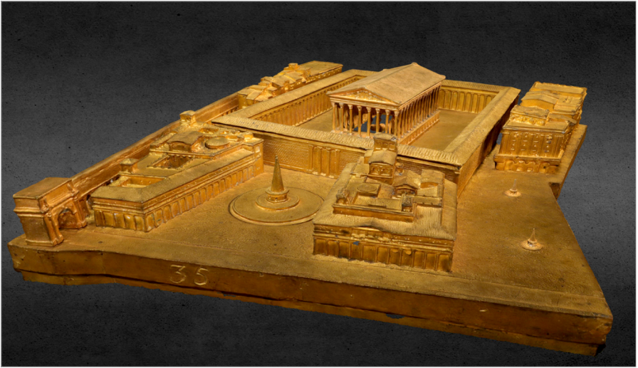
Fig 5: Module 35 of Bigot's bronze model: 3D output of the Temple of Hadrian (Campus Martius, Rome), © Université Paris 1 Panthéon-Sorbonne.

by the Sapienza University of Rome in the frame of its Atlas of Ancient Rome project. 11 All this work depends on the active involvement of students at every step of the process.