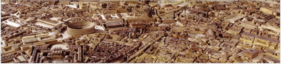
Fig. 1: Bigot's plaster model of Rome at the University of Caen (detail).

These are parts of the North of the City (i.e. Imperial Rome). All the cases had been opened, some sets are quite damaged by oxidation and we obviously do not know if the cases found correspond to all that had been completed or if there have been disappearances”. 3