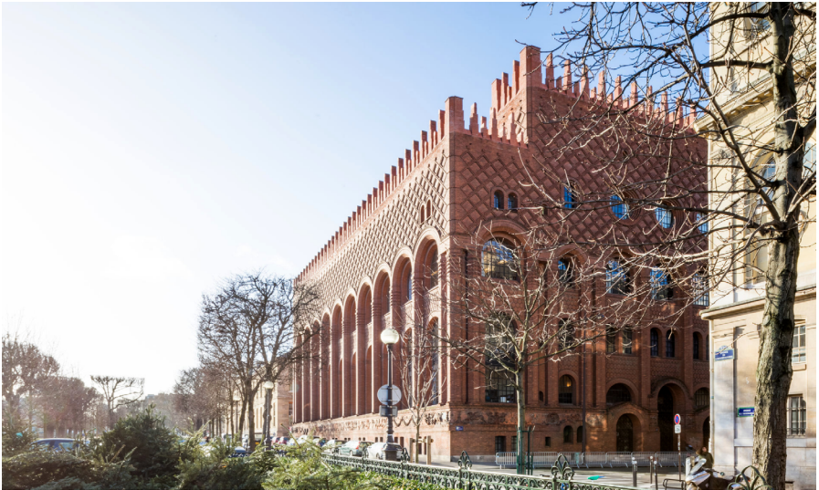
Fig. 2: The Institut d'art et d'archéologie in Paris, built from 1925 to 1928, by architect Paul Bigot.