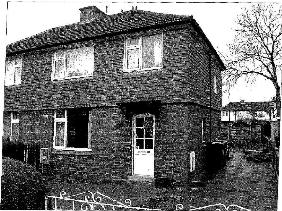
Fig. 1: 384 King's Road, Manchester, home of the Morrisseys