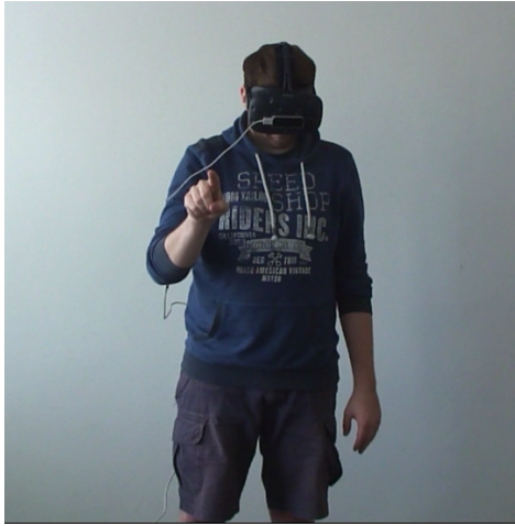
(a) Selection (Leap)