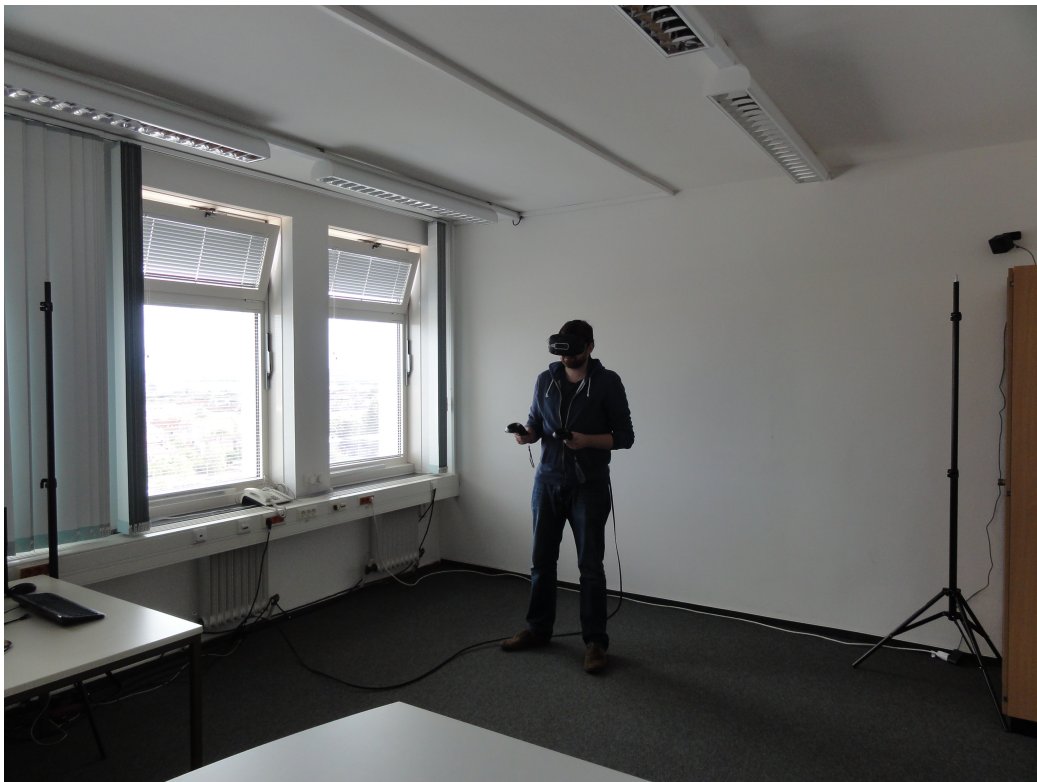
Figure 4: Setup for our virtual room