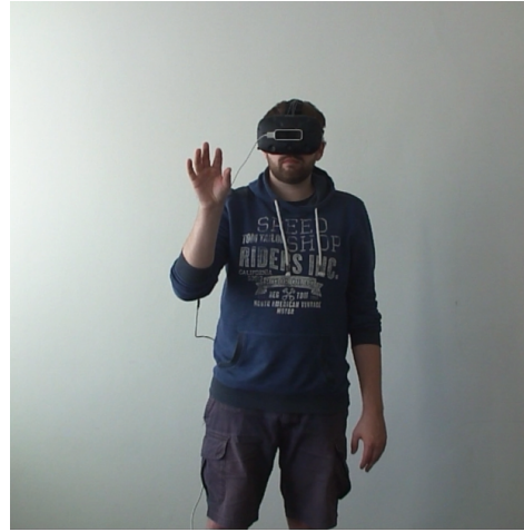
(b) Open Package (Leap)