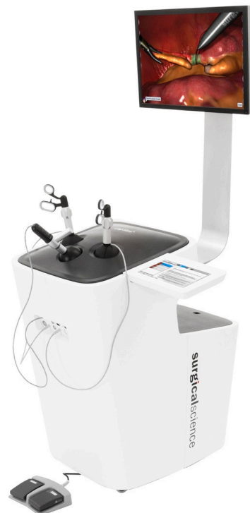
Figure 1. Shows the virtual reality simulator.

LapSim consisted of a 27-Inch LCD monitor, a keyboard and mouse, a windows PC, and Simball™ 4D joysticks, with a double footswitch. For the interaction with the VR environment, the simulator provided Sim-ball 4D joysticks, which had laser-marked ball joints, with three degrees of freedom that allowed real-time calculations of the exact 3D angular position. The input devices included a grasping instrument on the left and right sides and a camera instrument in the center (Figure 1).