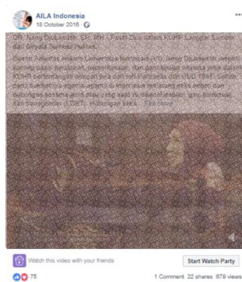
Table 1. Paraphrase and English translation of AILA Indonesia Facebook’s post.