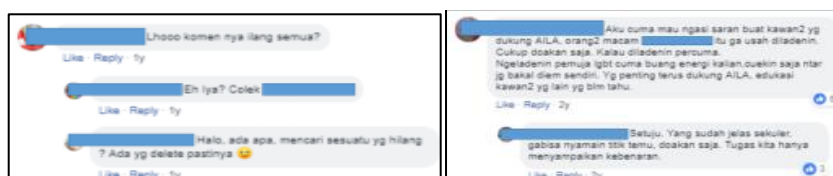
Figure 3. Facebook comments on Perkumpulan Arus Pelangi and AILA Indonesia post.

Fourth, we can see the sociomaterial practice from the sociomaterial assemblage practice conducted by both groups. Sociomaterial assemblage practice means an online community is a composite and shifting assemblage of the material and social, which change over time as those involved participate in online community activities to provide meaning, to exercise power, and to legitimate actions (Harris and Abedin, 2015). We found dominant interaction patterns in both groups when we see how users deal with legitimate action between humans and technology, such as “deleting comment”. We can see the examples in figure 3.