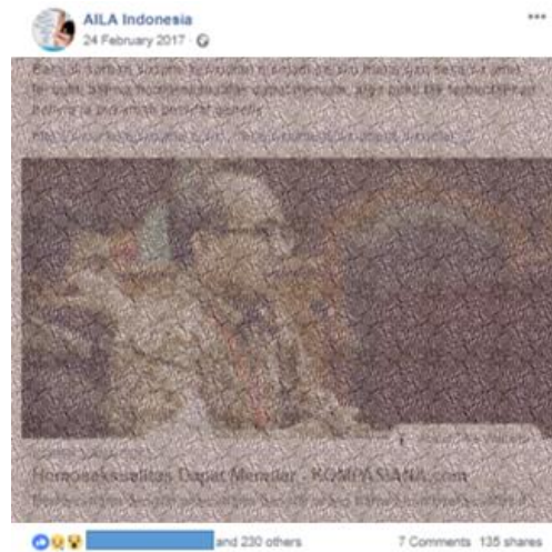
Table 5. Paraphrase and English translation of AILA Indonesia Facebook’s post.