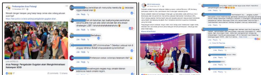
Figure 1. Perkumpulan Arus Pelangi and AILA Indonesia Facebook's post and discussions.

The figure shows how different is the interaction patterns of both group when dealing with LGBQ issues. In their Facebook's post, Perkumpulan Arus Pelangi waited for the result of judicial review from Indonesia's constitutional court regarding to Draft of the Criminal Code. The draft is important because if it was legalized, LGBTQ could be criminalized. In the comment, some users questioned why sexual orientation is criminalized and thought that it is a paranoid attitude. In contrast to Perkumpulan Arus Pelangi is a post from AILA Indonesia . The figure shows that AILA Indonesia accepts the constitutional court's decision and is grateful for the support of all parties. They also stated that their fight is not over yet. The comment shows a lot of support and prayer for AILA. Their support was more based on the argument of sake of the next generation. Taking account on how the affordances are enacted differently, Perkumpulan Arus Pelangi using a website link as an addition to their post while AILA Indonesia using a photo and hashtag to give illustration to their post.