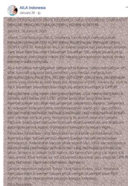
Figure 3. AILA Indonesia ’s post about public hearing session with the House of Representatives.

Nowadays, nationalism is considered to fade due to the many conflicts in Indonesia, one of which is the conflict in Papua. For this reason, many Indonesian people have re-echoed the nationalism issue. In this regard, nationalism issues is “me” because Indonesian people always call themselves as nationalist, for example, they are constantly using the phrase “NKRI harga mati” (Unitary State of the Republic of Indonesia is Undisputed), which means nationalism issues are part of Indonesian society. While, LGBTQ issues is “the others” because LGBTQ has been defined as something that came from the west because of globalization. For example, see figure 3 and 4, and also table 3 and 4.