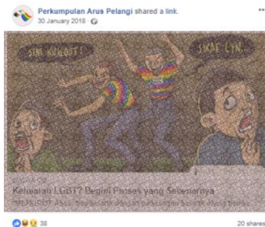
Figure 6. Perkumpulan Arus Pelangi posts link to counter many people who claim that LGBTQ is contagious.