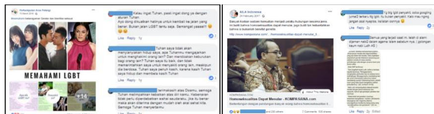
Figure 2. Perkumpulan Arus Pelangi and AILA Indonesia Facebook's post and comment section.

When discussing the LGBTQ issue, the different perspectives between Perkumpulan Arus Pelangi and AILA Indonesia as discussed on facebook pages can be explained as sociomaterial practices of both groups that are s constitutively entangled with the Facebook affordances. First, we can see it from the relationality practice that is being carried out. Relationality practice means online communities exist in relation to other assemblages. That is, within an online community, common interest unites agents, whereas across communities, differences in practices (such as participant needs) will create boundaries and potential conflict (Harris and Abedin, 2015). We can see the example in figures 2.