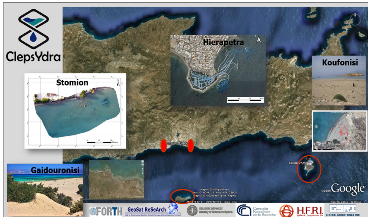
Fig. 2: Location of the ClepsYdra case studies in eastern Crete. The background base satellite map is taken from Google Earth (©2010 DigitalGlobe, Data SIO, NOAA, U.S. Navy, NGA, GEBCO, ©2010 European Space Imaging).

sites have similar chronology dated in the Roman Times and are located in the eastern part of Crete which is gradually sinking based on established geological and tectonic models (Mourtzas et al. 2016). Thus, the sample includes four shallow submerged and (partially) sand-buried sites in the Eastern part of the island of Crete including an important Roman settlement (Koufonisi islet), two pluri-stratified -prehistoric to Roman- sites (Gaidouronisi islet, and Stomion bay) and one ancient harbor (Hierapetra). (Fig. 2).