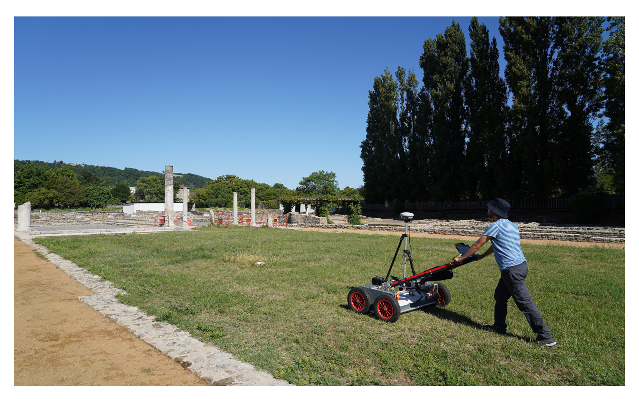
Fig. 1: GPR survey in the rooms of the Maison de Sucellus at Saint-Romain-en-Gal (France).

ern part with rooms organized around a large rectangular basin. The western part is occupied by the garden located 2 m below the house. This lower lying area was filled during the construction of the Maison de Sucellus .