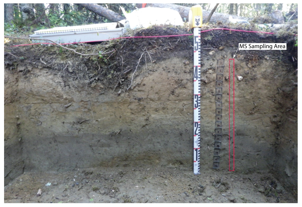
Fig. 2: Example of field and laboratory-based MS column sampling within EU3 and the Hess Creek Site (LIV-00001).

Proceedings of the 15th International Conference on Archaeological Prospection