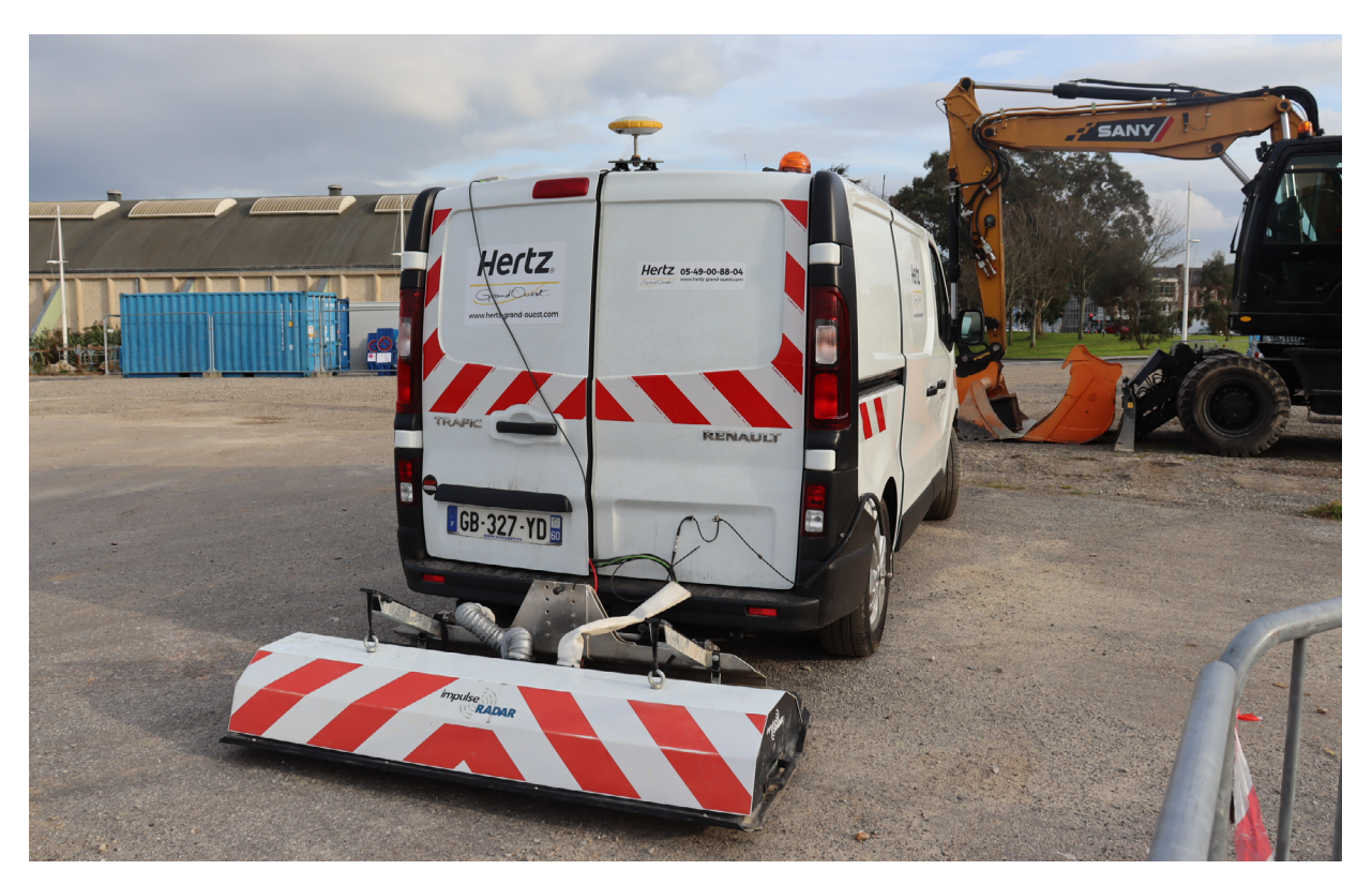
Fig. 1: Towed 18-channels Raptor GPR with GNSS positioning in Cherbourg.

Proceedings of the 15th International Conference on Archaeological Prospection