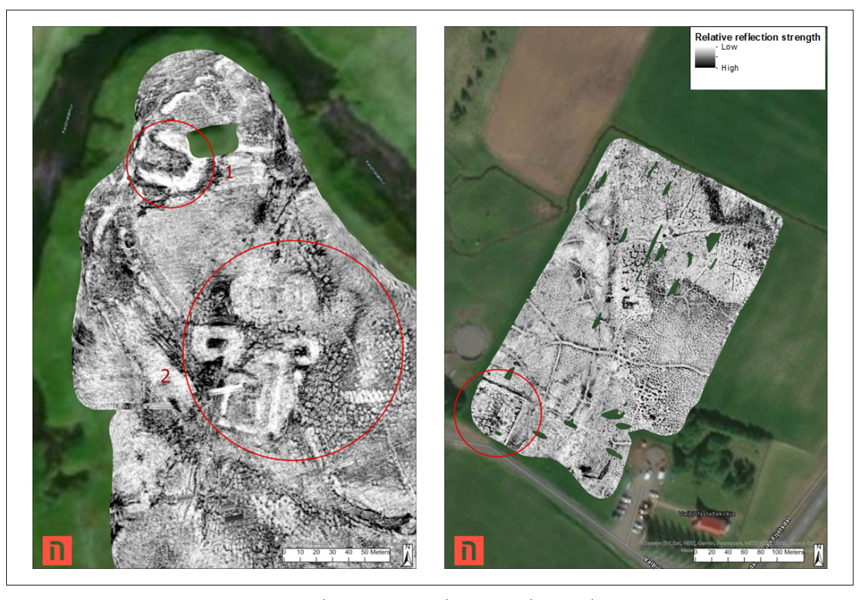
Fig. 3: Left image: GPR depth-slice from Keldur (120-160 cm depth). Turf walls (Area 1, 2) of old farm buildings are clearly visible as absorbing features. Right image: GPR depth-slice from Valþjófsstaðir (40-80 cm depth). The data show a variety of different geological patterns within one field. The graveyard with its enclosure and individual graves is clearly visible in the marked area. Background image: Esri ArcMap "World imagery" base map.

Radar Array (MIRA) equipped with 400 MHz antennas, mounted in front of a Kubota RTV900 (Fig. 2). Positioning was achieved with a RTK-GNSS system, mounted on top of the radarbox. Data processing and visualization was carried out using the software ApRadar, developed by the Central Institute for Meteorology and Geodynamics in Vienna and the LBI ArchPro.