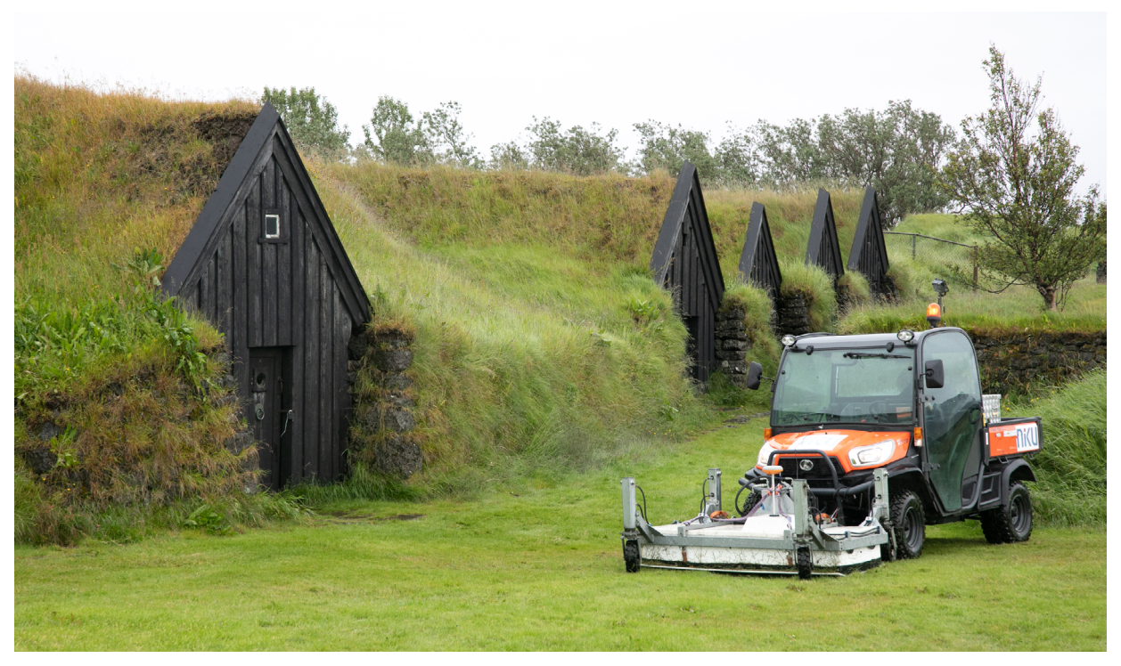
\textbf{Fig. 2:} \ \textbf{Motorized GPR system (MIRA) during the survey at Keldur with traditional turf houses in the background.