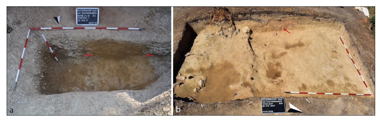
Fig. 3: Likely periglacial fissure filled with clay-rich sediment (a). Post hole and daub on rampart 3 (b) (Ratzersdorf project, IUHA Vienna).

magnetic signal (Fig. 3a). The geological feature was also confirmed during Electrical Resistivity Tomography (ERT) measurements (Krenn-Leeb et al. 2023). Conversely, the anomaly on rampart 3 did not show up as one distinct structure during excavations. Geological test trenching revealed west-east oriented fluvial processes in the location of the anomaly beneath and to the south of the rampart which appear to be following the natural slope and may show up in the magnetic data. A linear array of daub and postholes running roughly along the top of the rampart could intensify the positive magnetic anomaly (Fig. 3: b). Preliminary interpretations as to the cause of this anomaly are thus still inconclusive. The current state of research indicates that both anthropogenic and geological processes and structures are visible in the magnetic data and can be verified through excavations. Additional results are expected as excavations in this part of the site are still ongoing.