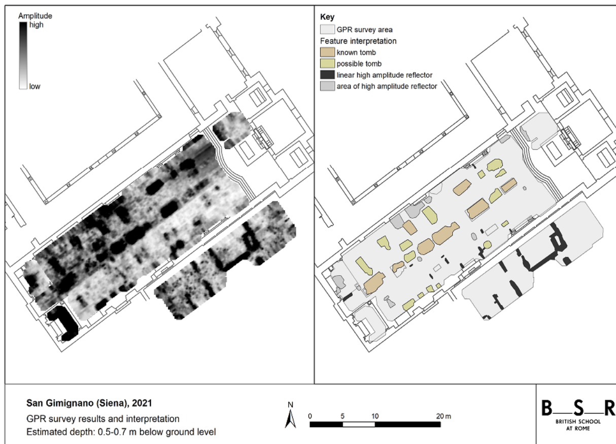
Fig. 1: Church of Sant'Agostino. GPR survey results and interpretation.

Map) for 2D visualization and analysis, and high iso-amplitude features were extracted from GPR-Slice as point clouds to be analyzed in a 3D environment (Cyclone 3DR).