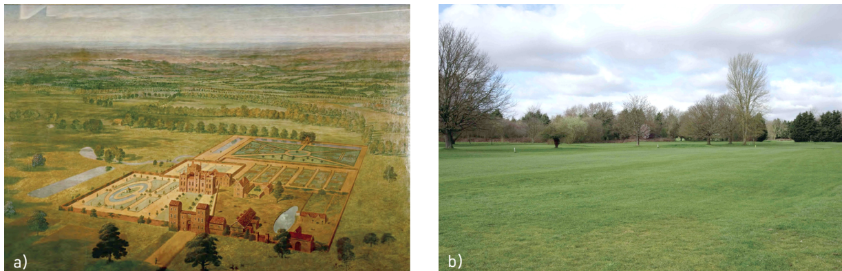
Fig. 1: a) Belhus Mansion Painting, c1710 unknown artist in the style of Jan Siberechts with permission from Thurrock Museum. Formal gardens are shown to the north and west of the central mansion incorporating elaborate water features, together with b) the site of the water gardens under the golf course today.