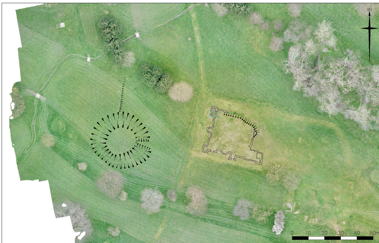
Fig. 2: Analytical earthwork survey hachures superimposed over an extract from the orthomosaic photograph.