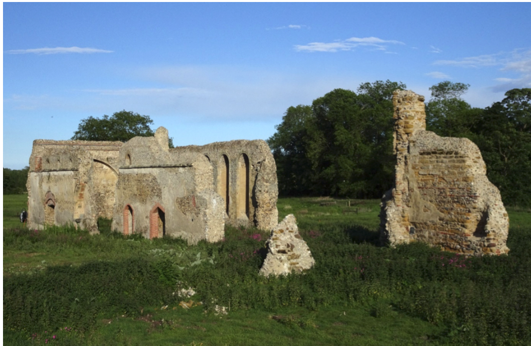
Fig. 2: View of the standing remains at Sibton Abbey, Suffolk.