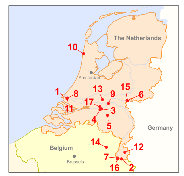
Fig. 1: Surveyed sites in The Netherlands and Belgium.

A standard way of working has been created for these medieval and post medieval sites with walls and moats where the area to be studies is mostly 1 to 2 ha in size. It always starts with a desktop study, carried out by the professional