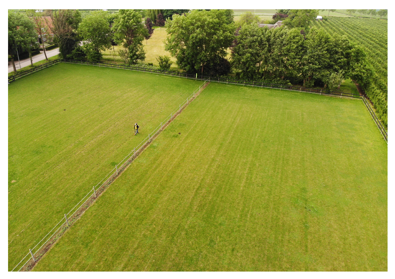
Fig. 2: Surveying with the CMD Mini Explorer.

Proceedings of the 15th International Conference on Archaeological Prospection