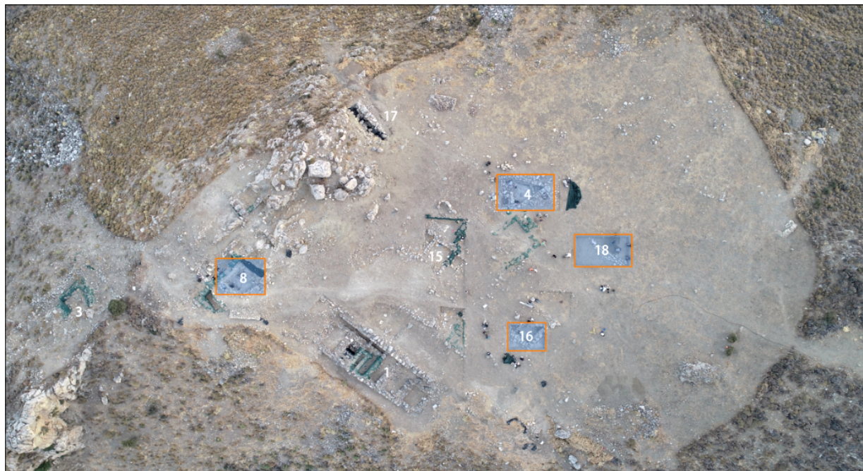
Fig. 3: Excavation results at the settlement area of Koumasa. Overview of the site and measurement areas (orthophoto: D. Panagiotopoulos).

ted a destruction layer (burning residues) dated in the Late Minoan I period (Fig. 3) (Panagiotopoulos 20220a).