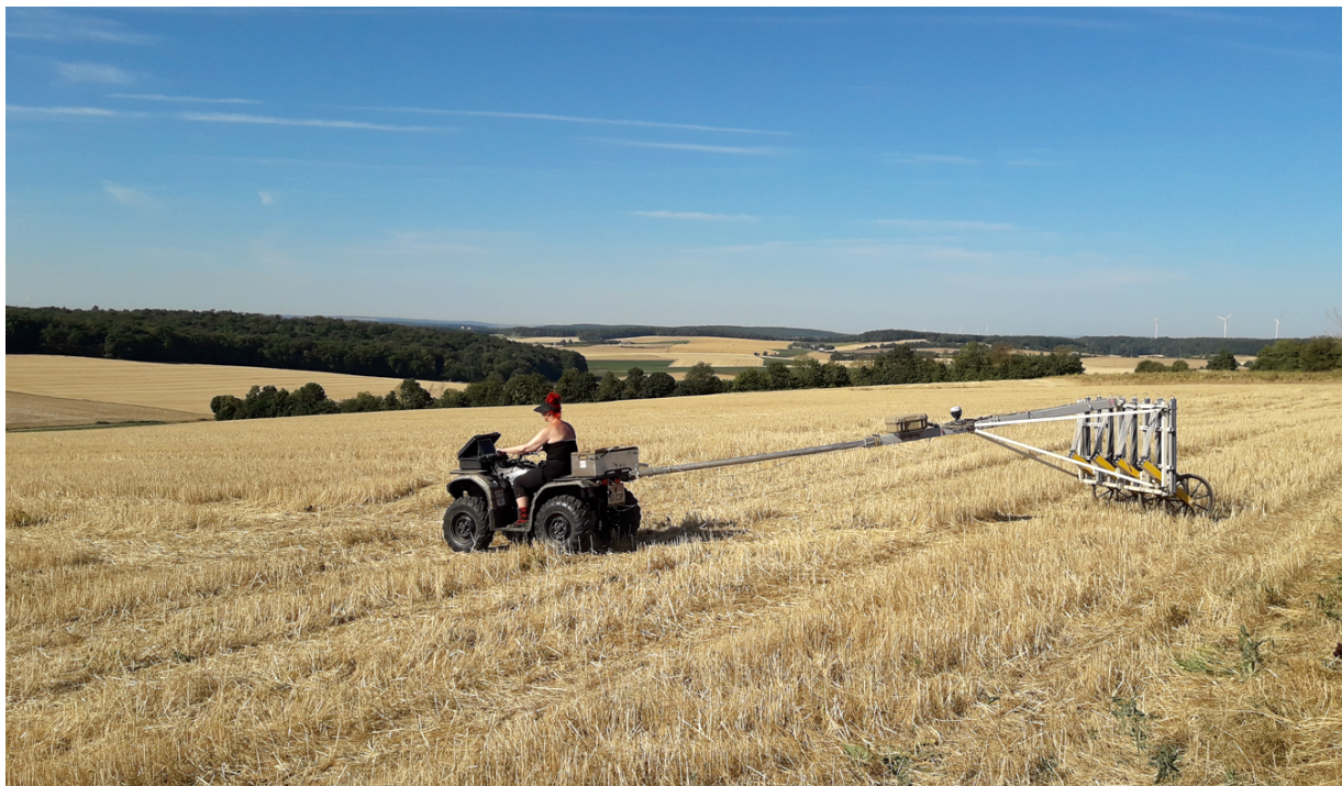
Fig. 2: Motorized measuring device in summer. The long-lasting daylight in summer makes it possible to work slightly longer each day if necessary. However, after the crops are harvested, the fields are quickly cultivated on the surface, which in turn can make the survey somewhat more difficult.

period and generated an invaluable basis for the non-destructive exploration of these large-scale settlements.