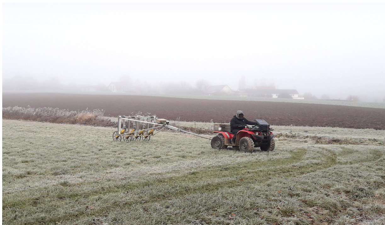
Fig. 1: Motorized measuring device on a cold winter morning. Weather is a serious factor in daily measurement performance. In winter, the days are shorter, but as shown on frozen ground optical navigation is easier.