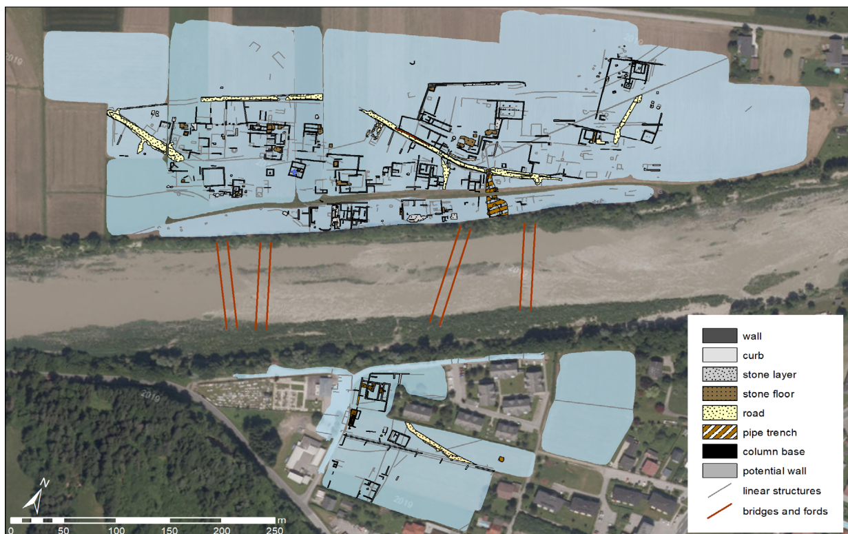
Fig. 3: Archaeological interpretative map of the Roman settlement of Emmersdorf/Rosegg (background data provided by INSPIRE BEV).