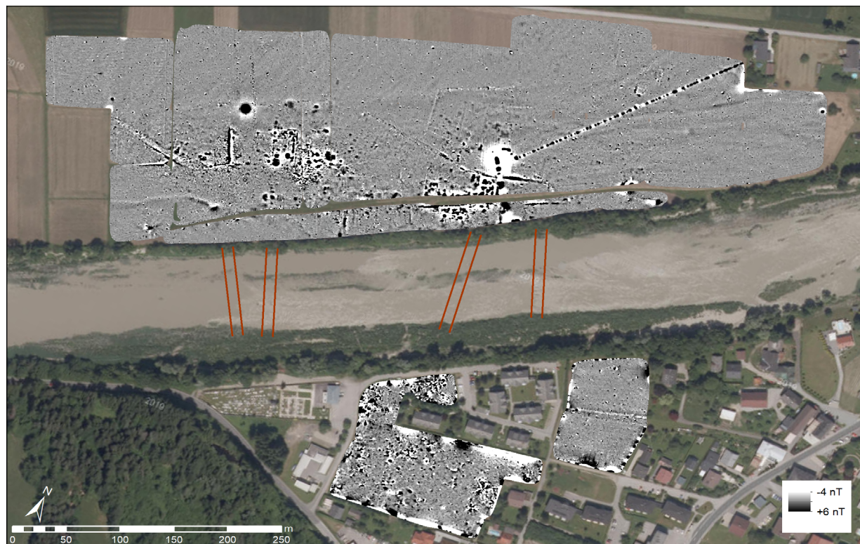
Fig. 1: Magnetic data image of the Roman settlement of Emmersdorf/Rosegg (background data provided by INSPIRE BEV).

software package by ZAMG (Trinks et al. 2018) and the resulting images and data integrated into ArcGIS Pro for further interpretative mapping.