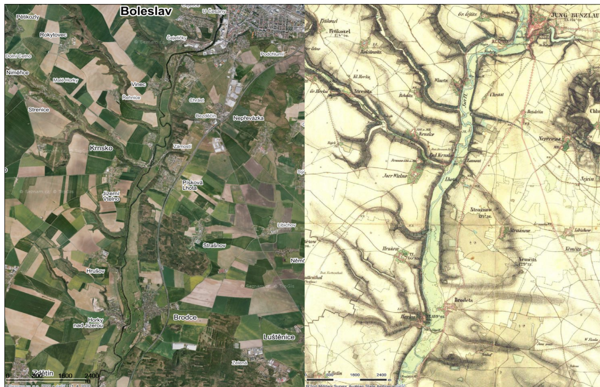
Fig. 1: Example of typical agricultural landscape area along the middle part of the Jizera River from aerial photography in 2020 compared with a segment of an old map of the second Austrian military mapping from the middle of 19 th century (source: www.mapy.cz ; © GEODIS BRNO, s.r.o. and © 2nd Military Survey, Austrian State Archive).

abandoned communications to flood plain area or across the river. Further, additional ERT profile measurements are planned in places of old meanders.