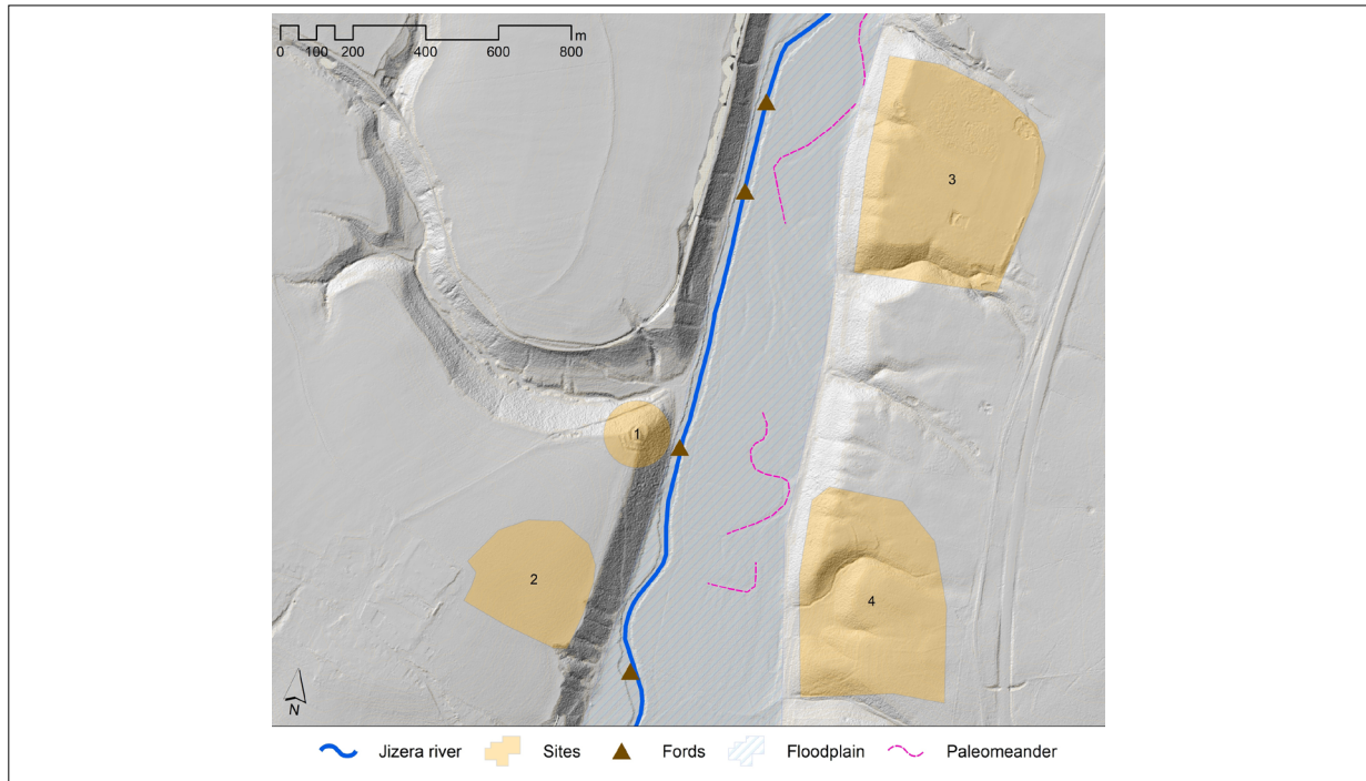
Fig. 2: Example of Lidar map along the middle part of the Jizera River and the main archaeological sites with clear relation to the riverine landscape. 1 - Middle Age stronghold Hrušov, 2 - Prehistoric settlement, 3 - Bronze Age and Early medieval hillfort area, 4 - Late Bronze Age and Hallstatt hillfort area.