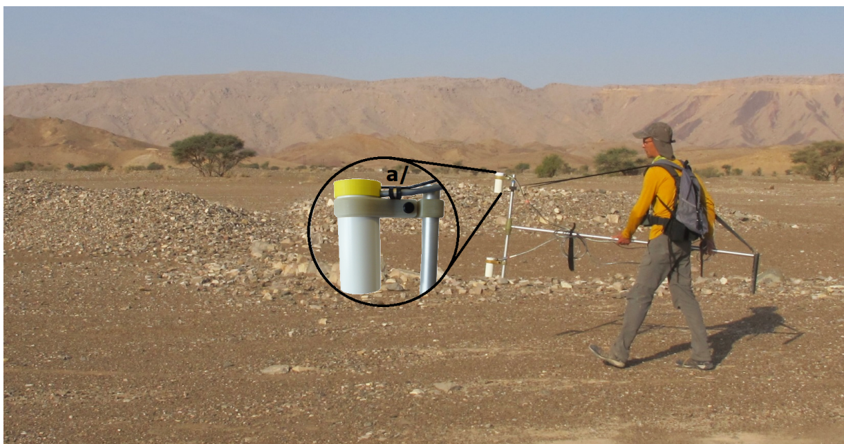
Fig. 2: Magnetic prospection coupled with ZheoPS system, © archaeological Mission Bat/al-Arid. C. Castel.