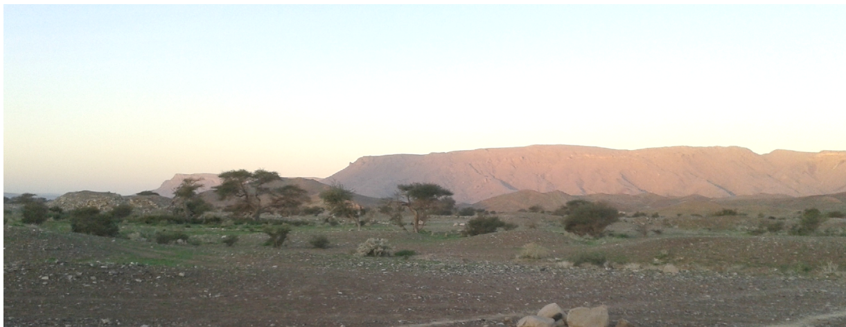
Fig. 1: Bat/At-Arid site general view, © archaeological Mission Bat/al-Arid. C. Castel.