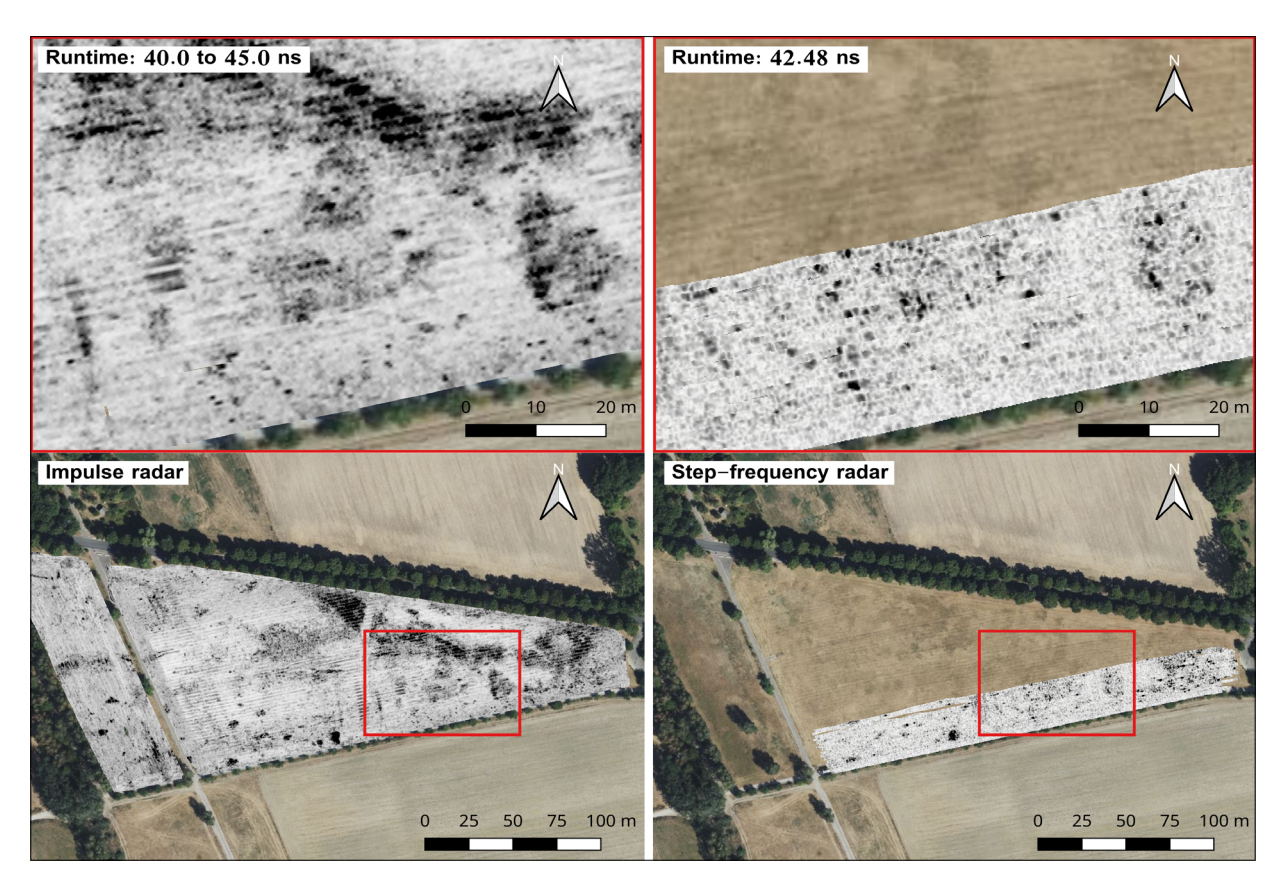
Fig. 2: Results of the GPR measurements with a depth of 2.00 – 2.25 m for the impulse radar (left) and about 2.12 m for the step-frequency radar (right). Timeslices are shown as general view (bottom) and detail section (top). Low reflection amplitudes are shown in white, high ones in black.