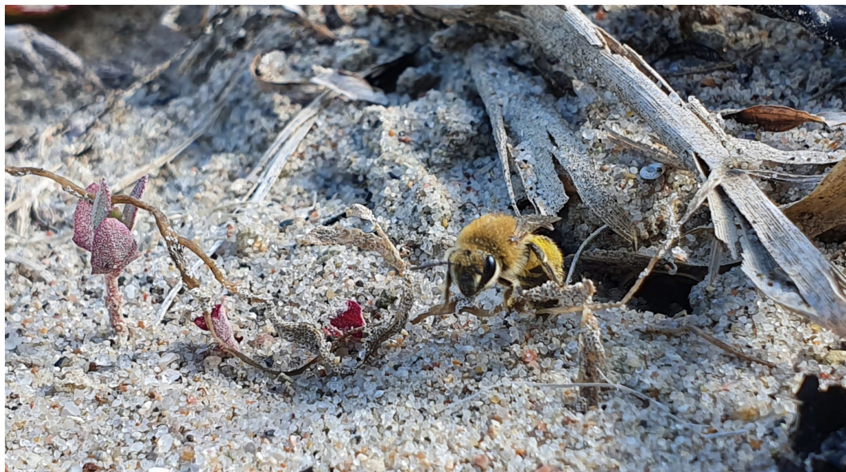
Fig. 3: Nesting site of Colletes halophilus in Eichholz.

distribution and contact between populations at the North Sea and the Baltic Sea coasts. The northernmost known population on the Danish west coast (North Sea) is on the island of Fanø (Madsen et al. 2015) and in the east (Baltic Sea) on the island of Fyn. However, the occurrence of C. halophilus on the west coast of SH and Denmark is assumed to be of relatively recent origin and the result of northern range extensions driven by global warming (Klammer et al. 2021). But as C. halophilus is easily overlooked due to its late seasonal flight activity and the special habitat requirements, it is also possible that the species has a long established and more or less continuous occurrence because coastal sites are often neglected in wider bee surveys. Thus, to get some clarity about this it would be necessary to continuously investigate suitable sites along the west coast of Jutland, as the most likely immigration routes and contact zone.