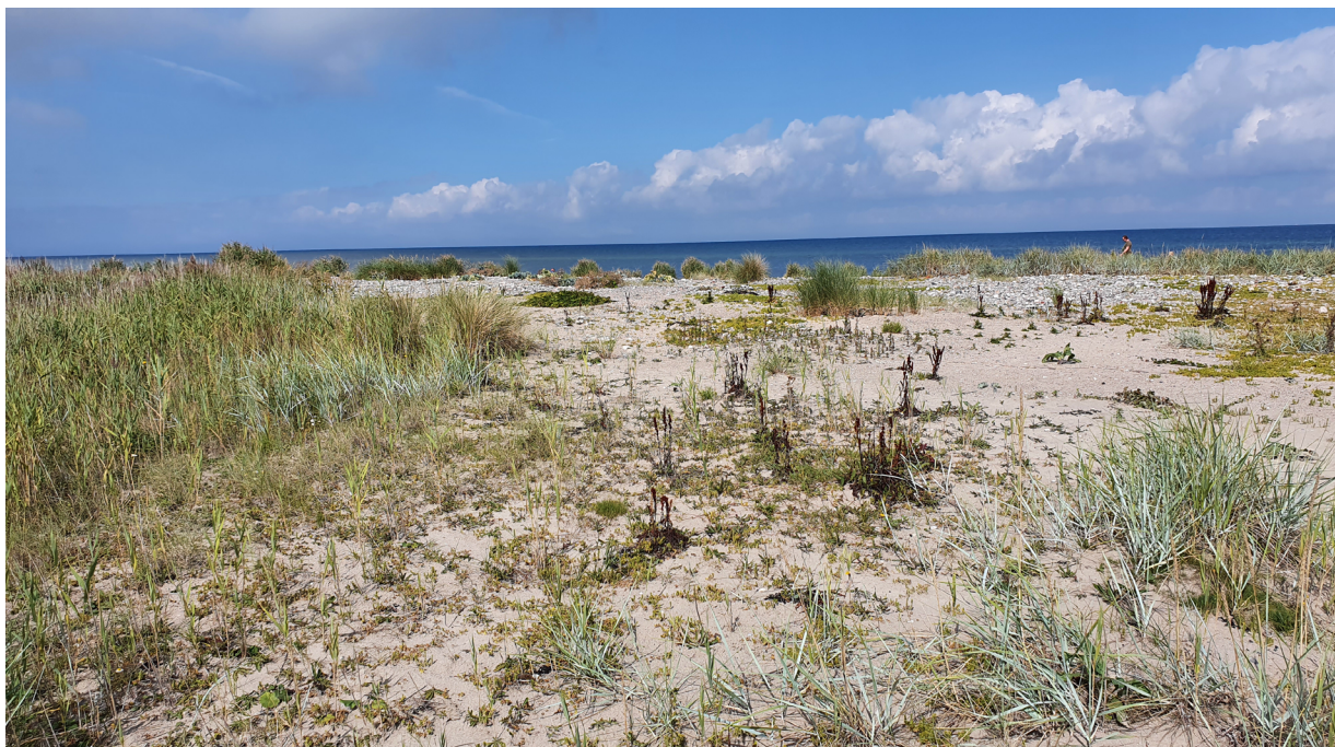
Fig. 2: The largest population of Colletes halophilus found in SH so far is in Eichholz.

can be extremely localised and restricted to a few 100 m 2 even when sites appear to be suitable for a larger scale colonisation, at least to the human eye. Colonised sites were characterised by a rich floral display of T. pannonicum in very close vicinity to sunny dry open to sparsely vegetated sandy soil (e.g. coastal dunes, dyke) for nesting. The Sea Aster often is the only abundantly available Asteraceae and they are frequently visited by males and females. When males are active before T. pannonicum is in bloom they were observed patrolling along and visiting flowers of Daucus carota for nectar.