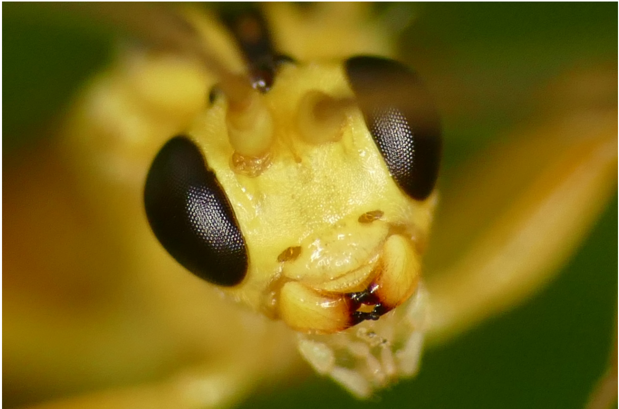
Fig. 1: Male, head, 14 May 2022, Mohrkirch, Germany.