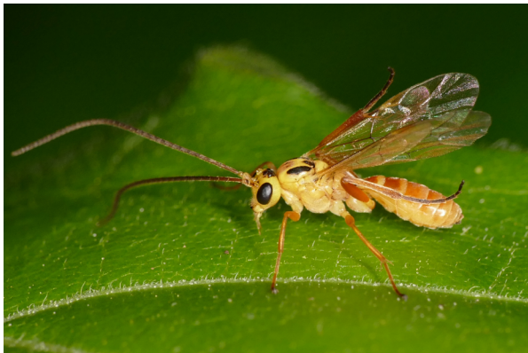
Fig. 2: Female, habitus, 18 May 2020, Mohrkirch, Germany.