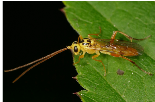
Fig. 3: Male, habitus, 18 May 2020, Mohrkirch, Germany.