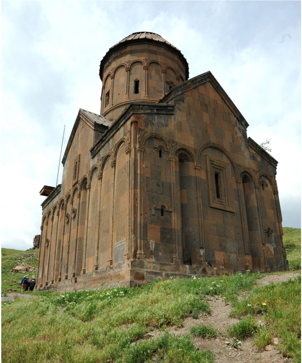
Fig. 6: Ani, St. Gregory Illuminator Church of Tigran Honents, view from south-east.