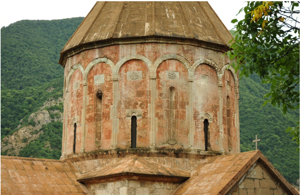
Fig. 11: Davivank. The drum from north-east.