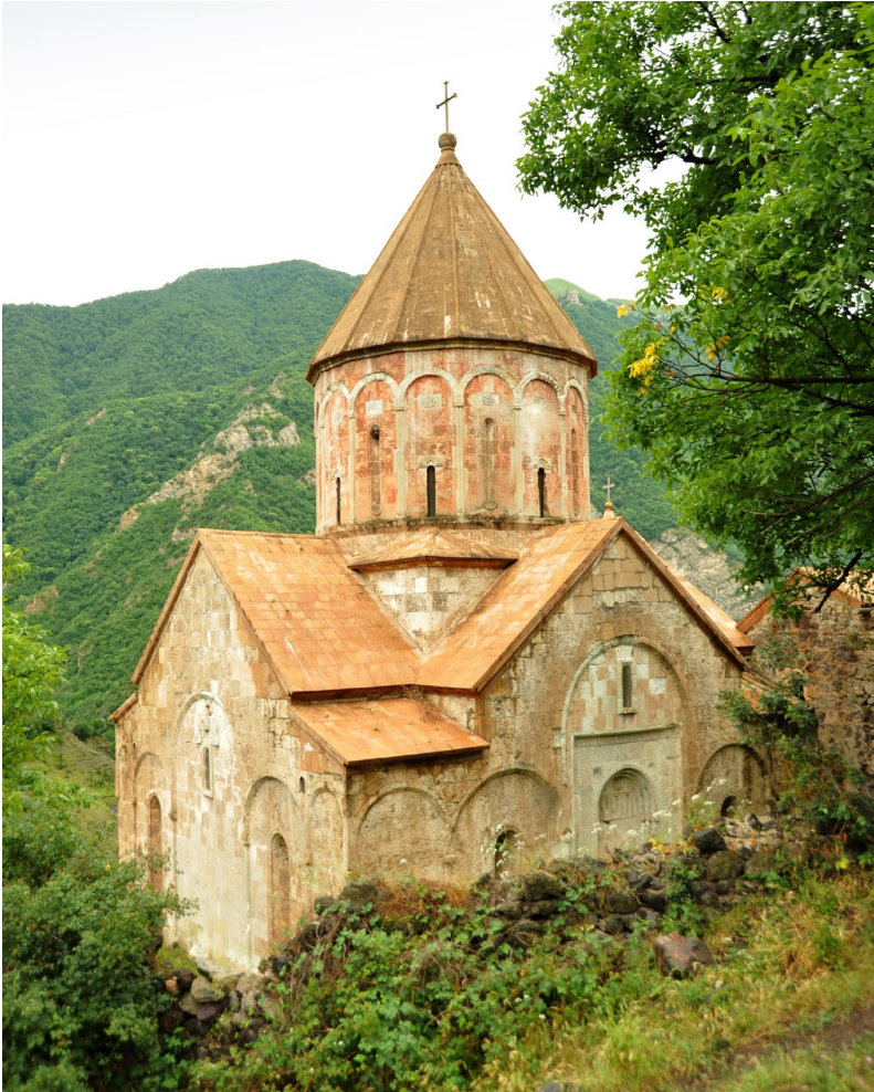
Fig. 3: Dadivank. Cathoghike Church. View from north-east.

Samvel Ayvazyan. 5 In 2014–2017, the murals that were concentrated on the northern and southern walls of the inner space were fully discovered and cleared by Ara Zarian and Christine Lamoureux. 6 Both of these books, the main purpose of which was to present the archaeological and conservation work on the site, contain sections describing and analyzing the architectural features of the Dadivank Church.