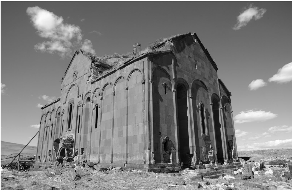
Fig. 8: Ani Cathedral. View from south-east.