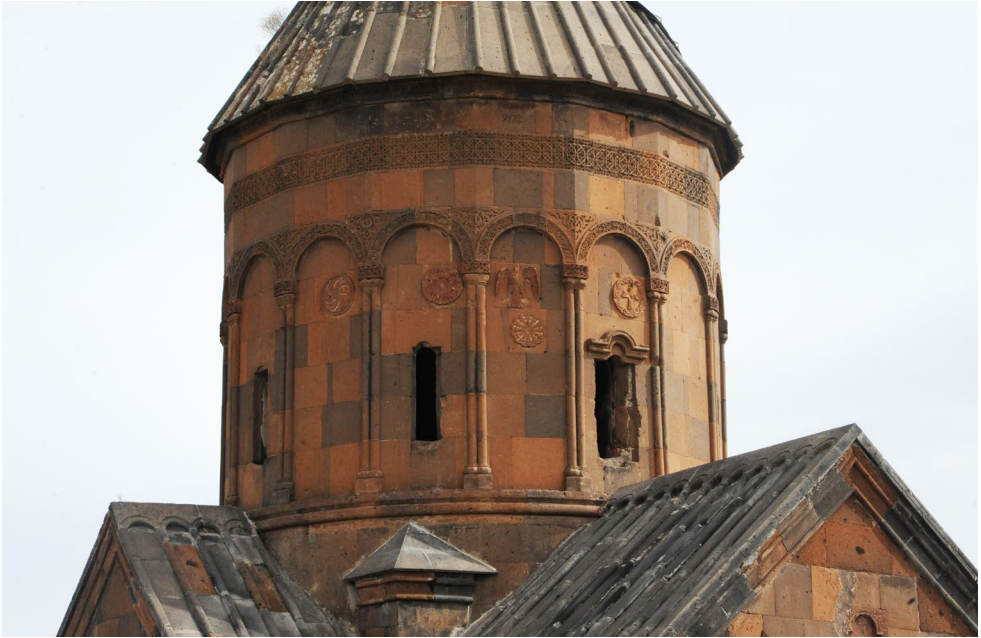
Fig. 7: Ani, St. Gregory Illuminator Church of Tigran Honents, the drum from north-west. Photo by A. Kazaryan (2022). All rights reserved.