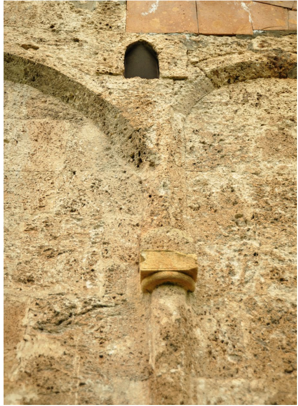
Fig. 12: Dadivank. Fragment of the blind arcade of the eastern façade.

because we do not find rosettes arranged with such regularity and exactly along the axes of the archivolts in other monuments of Armenian architecture. Secondly, in order to give substance to this version, it is possible to look at the almost forgotten reconstruction of the Ani cathedral, which has this kind of rosettes.