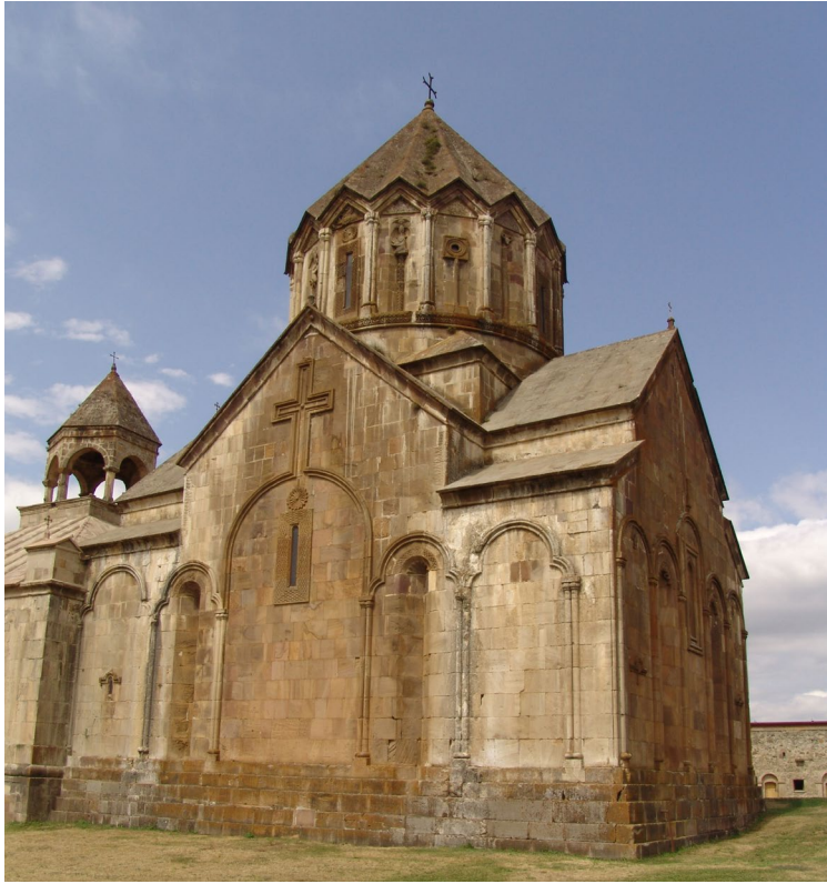
Fig. 5: Church of the Gandzasar Monastery, view from south-east.

plified version is a composition with a blind arcade on a high drum only and, accordingly, with smooth walls of the main volume. Such are the churches of Geghard (1215), Makaravank (1198), the recently restored church of Astvatsnkal (1244).