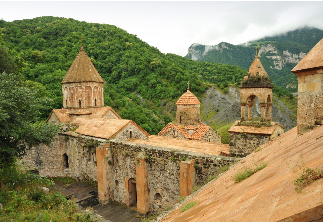
Fig. 1: Dadivank. Main view of the monastery from north-west.

The interest in the architecture of this church and in studying the origin of its architecture gets bigger. Moreover, in the last couple of years, the Udins' community of Azerbaijan, with the support of the authorities of that country, was trying to claim its rights, as supposedly the heirs of all parts of Aghvank (Caucasian Albania), to the Christian shrines of Artsakh. Earlier, Azerbaijani scholars systematically engaged in the ›Albanianization‹ of the Armenian heritage of Nagorno-Karabakh, from time to time receiving a rebuff from their colleagues from other countries. The solution of the problem presented in my article should clearly reveal the complete inconsistency of such pseudo-scientific political claims. I am to do this solely by means of an architectural analysis of this monument in the context of Armenian architecture.