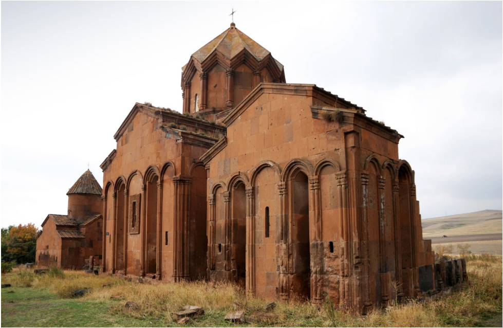
Fig. 10: Marmashen Monastery. View from north-east.