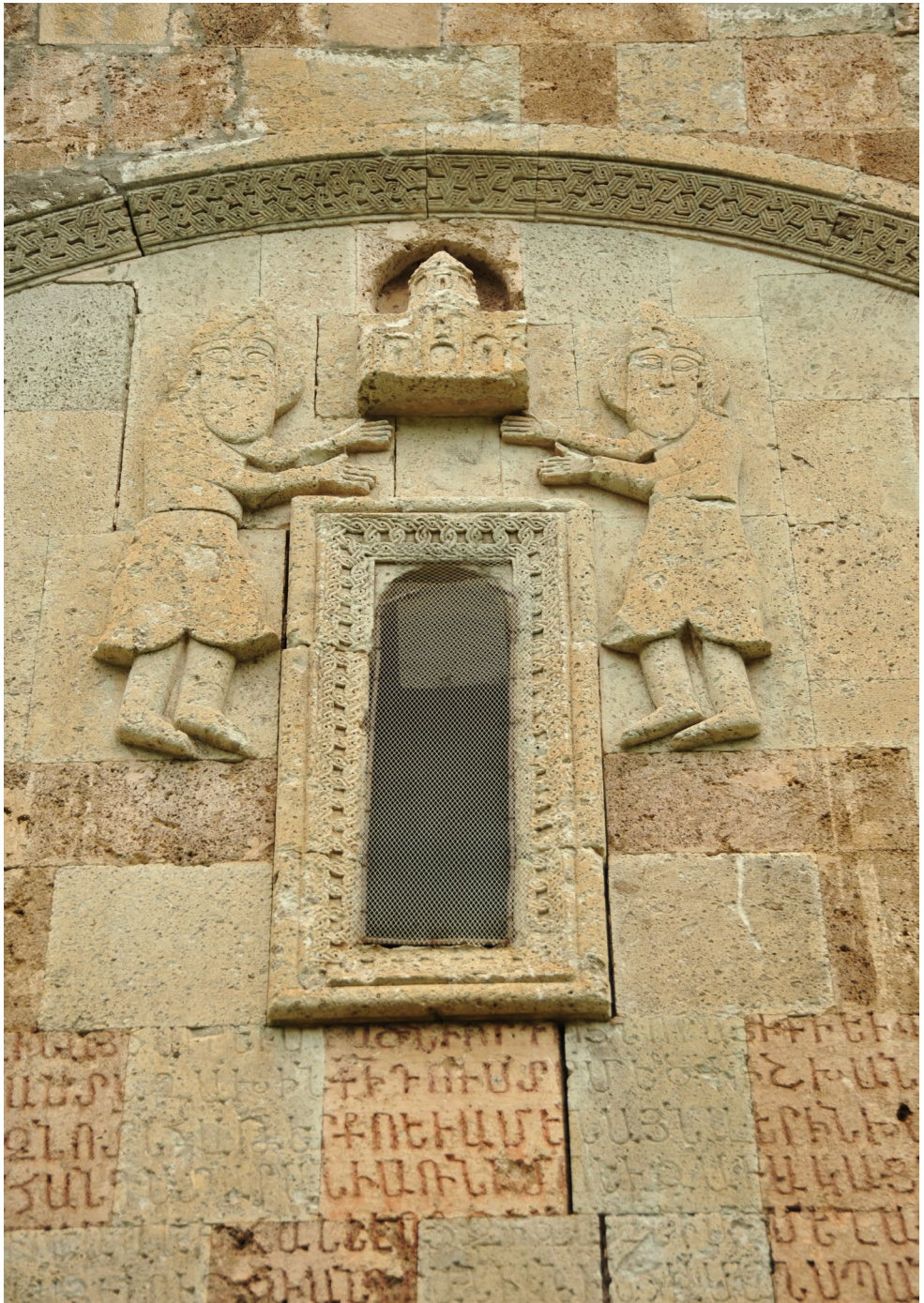
Fig. 4: Dadivank. Ktitors relief on the southern façade.