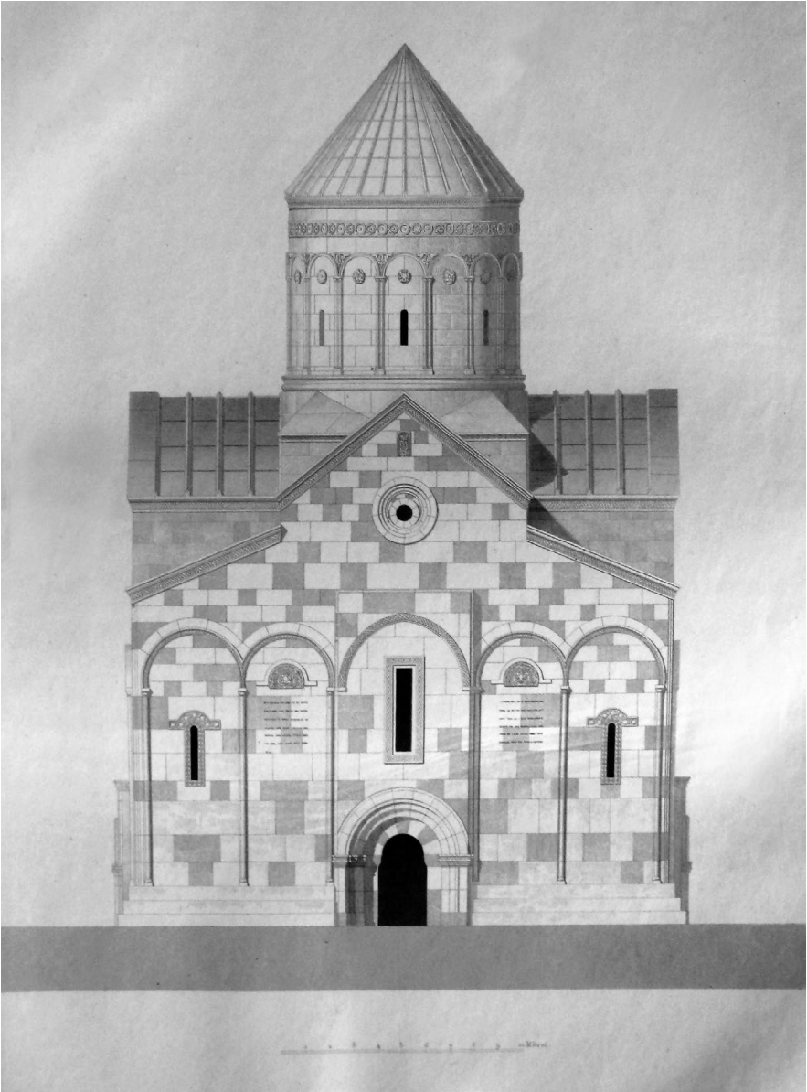
Fig. 9: Ani Cathedral. Reconstruction of the western façade from: Texier 1842, pl. 20.