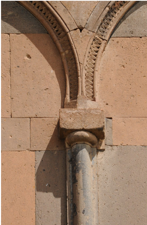
Fig. 13: Ani Cathedral. Fragment of the blind arcade of the southern façade.

of them unanimously refuse depicted rosettes, apparently considering them to be the result of the French researcher's fantasy. Now we can safely suspect that in the first half of the 19th century there were many more details of the collapsed dome, and among them were fragments of a drum, including rosettes. In addition, there are some rosettes on the arcade's fields on the drum of the church ordered by Honents in Ani, oriented to the cathedral. By contrast with Dadivank, the drum of this church has a frieze above the blind arcade. So, in a certain sense, it is more fully a copy of the Ani cathedral's image. We may conclude that the architects of both of these churches collected a number of details into a common pattern, and developed them to a specific style on its own.