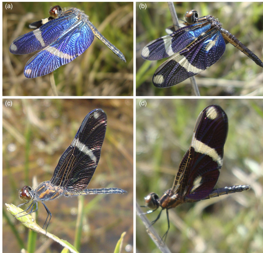
Figure 1 A Zenithoptera lanei male perched in its territory showing the iridescent wings with a bright UV-bluish dorsal surface (a) and a dark metallic-red ventral surface (b). A female perched and exhibited its bluish dorsal wing surface (c) and the darker ventral surface (d) against the Brazilian savannah visual background

with a deuterium and tungsten halogen light source (DH-2000-BAL, Ocean Optics Inc, Dunedin, FL, USA). The spectral range of the light source ranged from 200 to 1100 nm. The light was guided through a 200 \mu\text{m} glass fibre positioned 2 mm above the sample. The reflected light was collected by the same fibre and guided to a spectrometer (HR-4000, Ocean Optics). Spectral data were processed by the Spectral Suite software (Ocean Optics). Electrical noise was smoothed with a span of 0.25 using the pavo package (Maia et al. , 2019) in R environment (R Core Team, 2021).