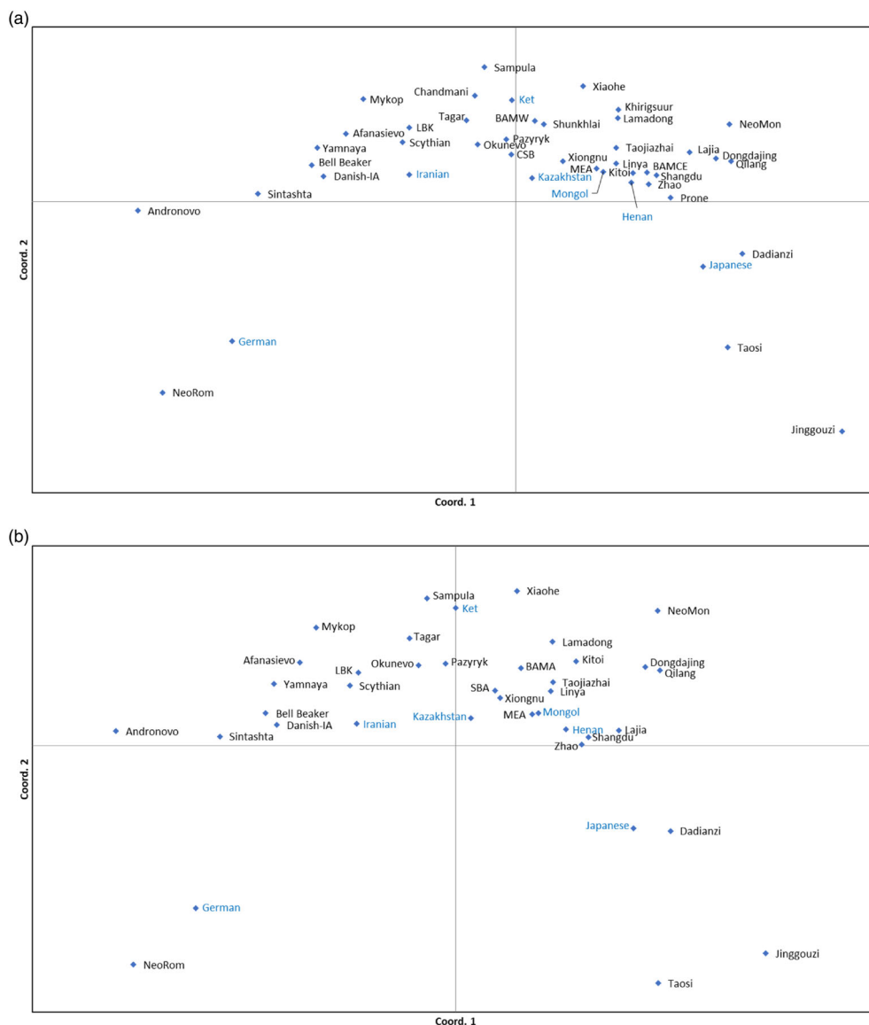
FIGURE 1 PCoA. (a) Is a PCoA of regional specific populations while (b) shows distances between aggregated populations. BAMA, Bronze Age Mongolia aggregate; BAMCE, Bronze Age Mongolia central eastern; BAMW, Bronze Age Mongolia Western; CSB, central slab burials; Danish-IA, Danish iron age; LBK, linear beaker culture; MEA, Mongol empire aggregate; NeoRom, Neolithic Romania; SBA, slab burial aggregate. Populations in blue are modern populations for scale

The mtDNA hgs: A, B, C, D, F, G, M, Y, and Z, are generally considered “eastern” Eurasian, and are currently found in high frequencies in the populations of East Asia, Central Asia and Siberia. The mtDNA hgs: H, HV, I, J, K, N, R, T, U, V, W, and X, are commonly considered to be “western” Eurasian, as they are currently found in highest frequency in the populations throughout Europe and southwest Asia (Derbeneva, 2009; Derenko et al., 2007; Gonzalez-Ruiz et al., 2012; Gubina et al., 2016; Keyser-Tracqui et al., 2006; Schurr & Pipes, 2011; Zhao et al., 2015). Twelve of the 20 samples sequenced in this study were eastern haplotypes (60%) and eight were western haplotypes (40%). The SBA ( n = 35 ) had 25 eastern haplotypes (71.43%) and 10 were western