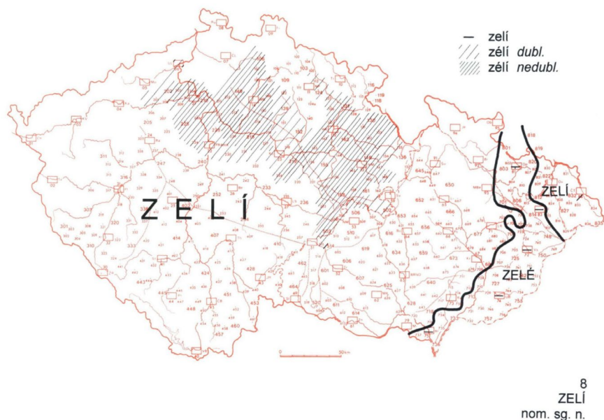
Fig. 2: For better orientation, I enclose a dialect map (ČJA, 4: 57).