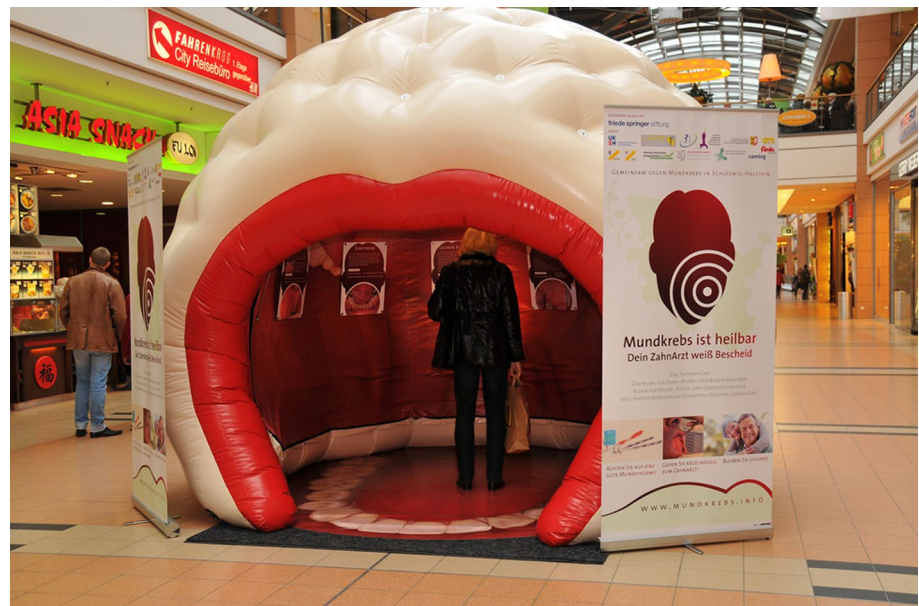
Fig. 1 The walk-in mouth model

organised for the campaign launch, interviews with journalists from the local and regional press, and appearances at events (e.g. sporting events) or a presence at consumer fairs were organised. The entire press work was comprehensively documented.