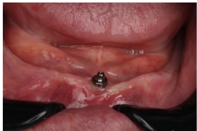
Fig. 2 Ball attachment

system into group C (CM-LOC attachment) and B (Ball attachment) (Figs. 1, 2). In group C, the “medium” (green) retentive inserts, while in group B the transparent nylon retentive inserts were used. The ball attachments had cuff heights of 2 and 4 mm, while the C attachments had 2-, 3-, 4- and 5-mm cuff heights. The required cuff height of the attachment was determined by a periodontal probe that measured the distance from the base of the implant to the upper border of the soft tissue.