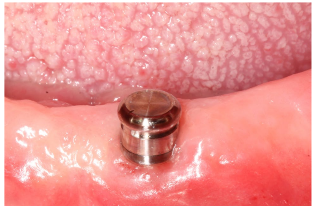
Fig. 1 CM-LOC attachment

A small crestal incision was made in the mandibular central incisor area. Sequential implant bed drilling was carried out following the manufacturer's instructions. After installing the selected implant (Tapered Screw-Vent, Zimmer Biomet, Carlsbad, CA, USA) of a standardized size ( 3.7 \times 10 mm), implant stability was measured using a resonance frequency analyzing device (Osstell, Integration Diagnostics Ltd., Sävedalen, Sweden) and a torque wrench to exclude implants with ISQ values < 60 and insertion torque < 30 Ncm. Based on the randomization, patients were assigned into N or S groups. In the N group patients received a healing abutment, while in the S group a cover screw was attached to the implant. Implants were left to heal for a 3 month-period, during which the patient was allowed to use a properly relieved and soft lined denture (GC soft liner, Corporation, Tokyo, Japan). At that stage patients were rerandomized based on the attachment